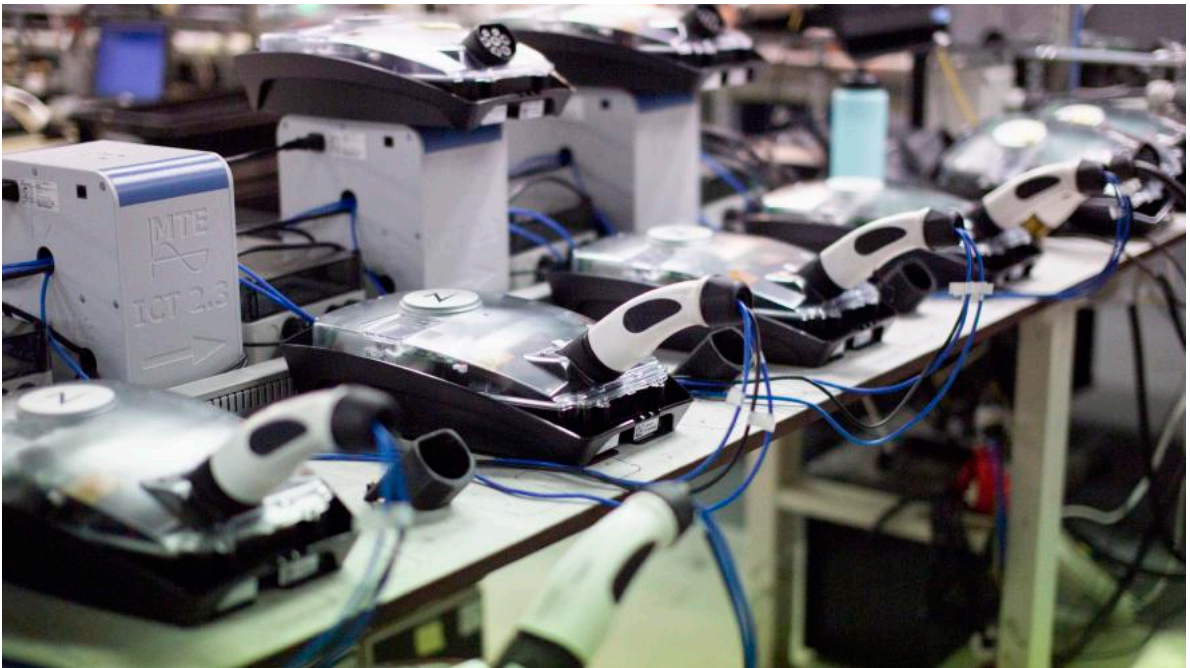
ZAPTEC Pro assembly line at Westcontrol factory in Tau, Norway