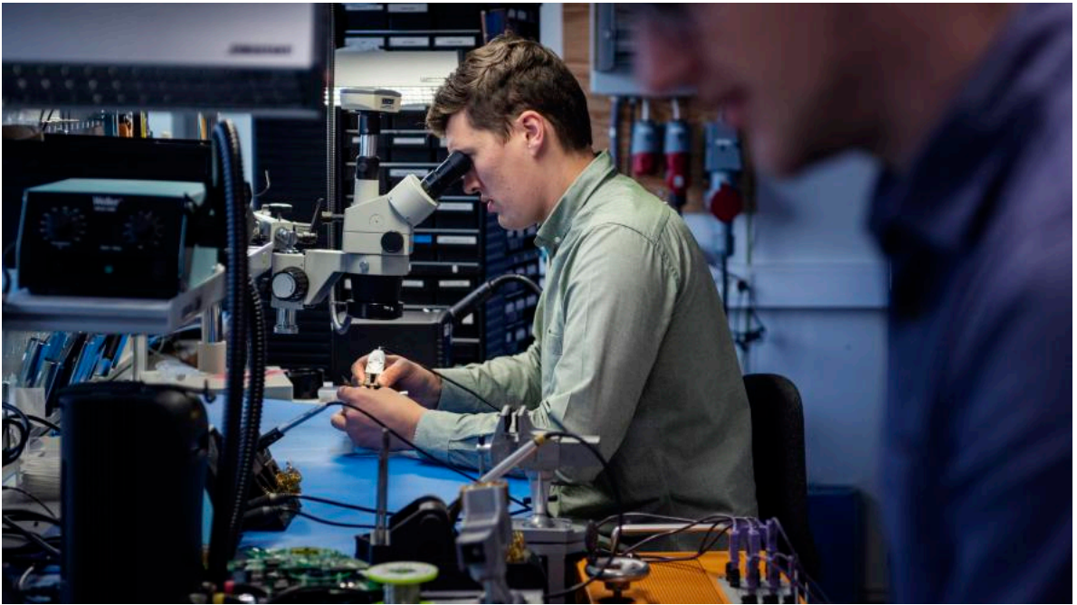
Product development at ZAPTEC headquarter in Stavanger, Norway