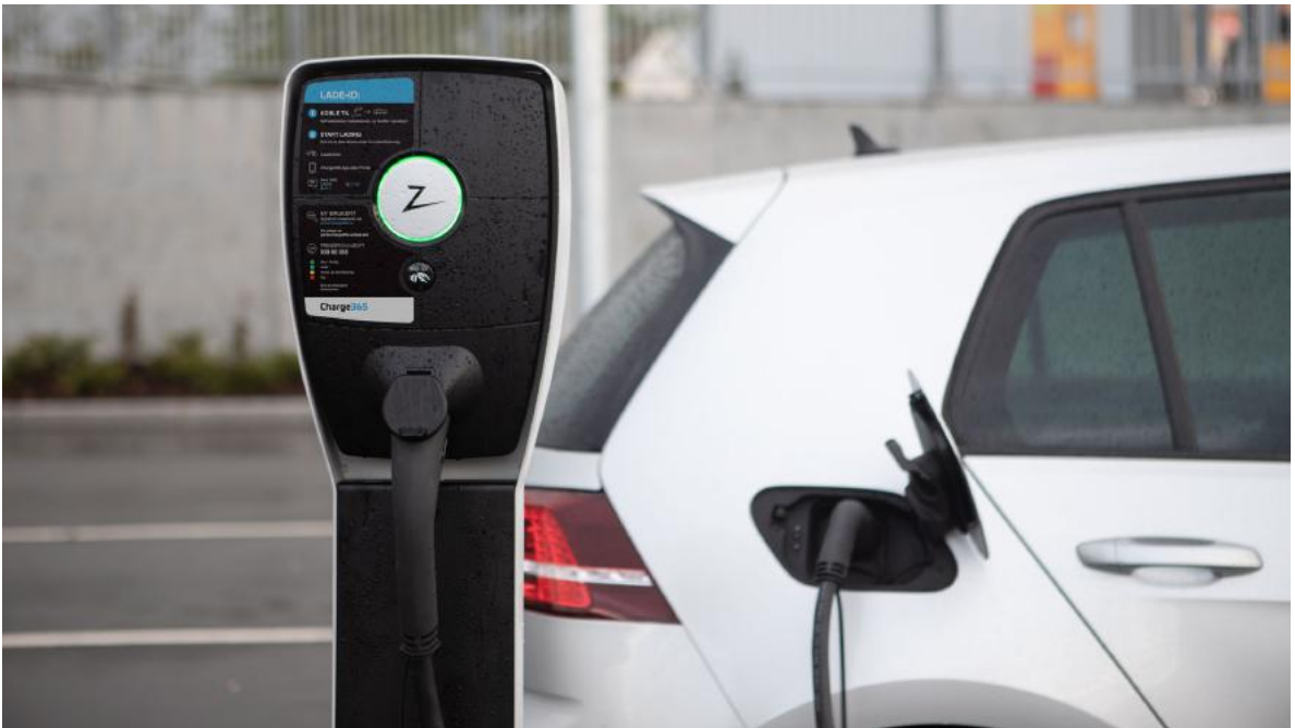
ZAPTEC Pro charger with Charge365 payment solution