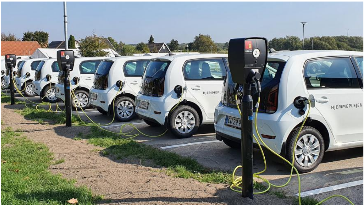
ZAPTEC Pro charging system in use by Hillerød municipality in Denmark.