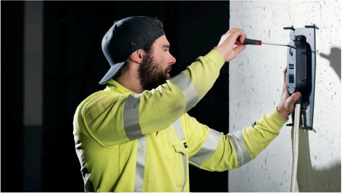
Installation of ZAPTEC charger backplate with certified partner