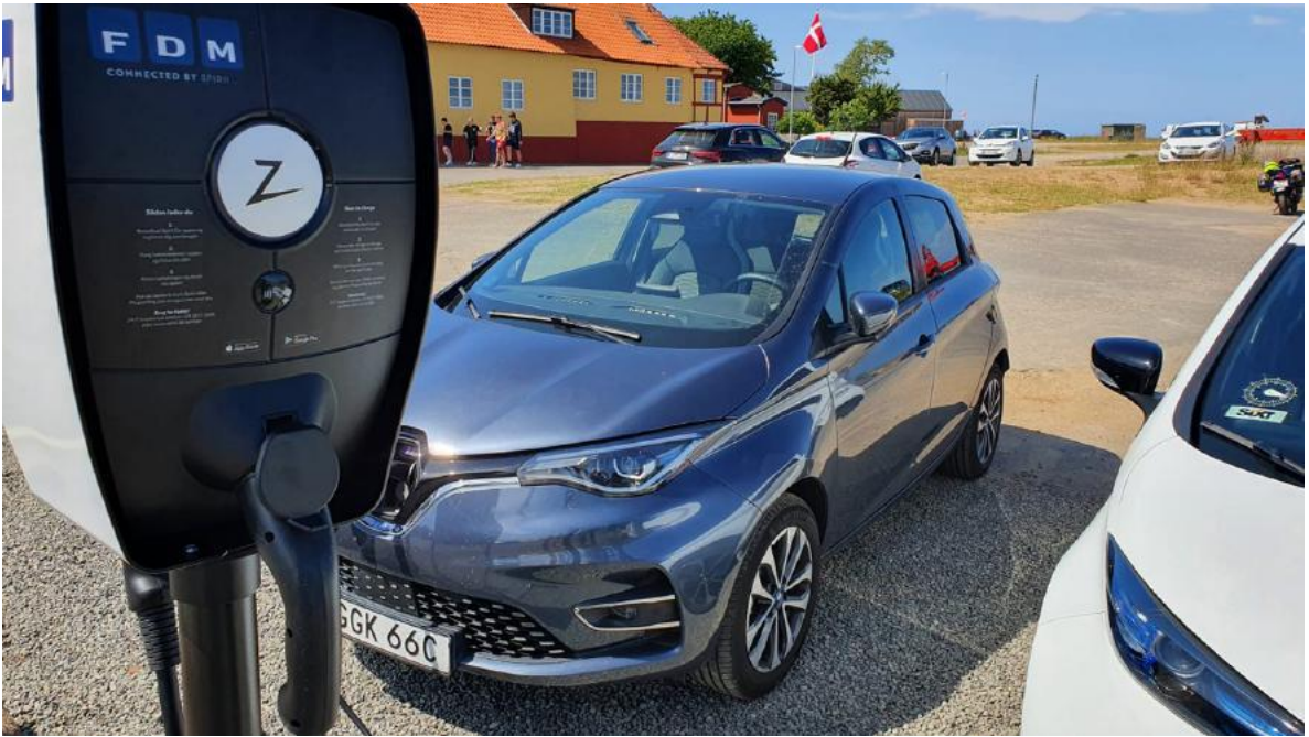
ZAPTEC Pro installed by our partner Spirii in Bornholm, Denmark.